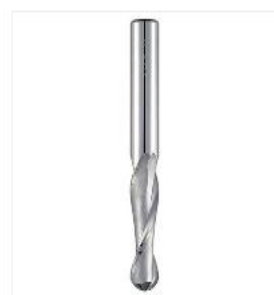
Ball Nose Cutters