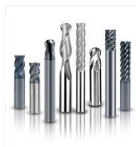
Solid Carbide Cutters