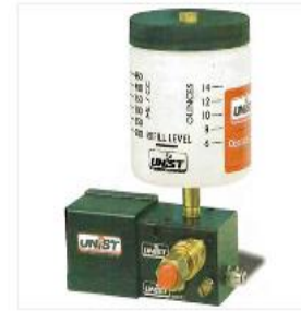
Micromist Cooling Systems