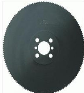
HSS Circular Saw Cutter