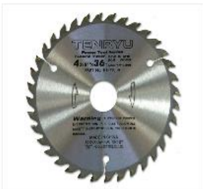
For Wood (LAQIV-III Series)