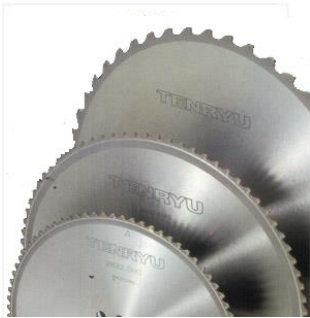
For Ferrous Metals