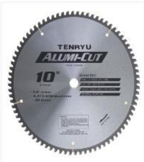
For Non-Ferrous Metals