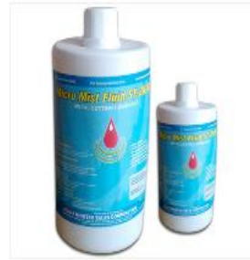
Micro Mist Fluid ST - 2020