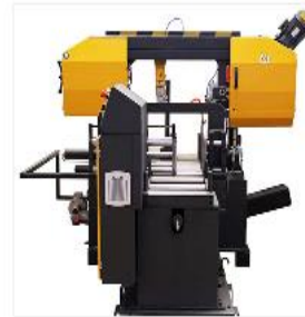
Band Saw Machines